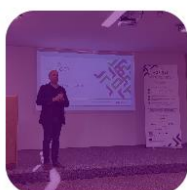
Mentoring and widening partners together in Hungary