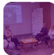
Professor women can be role models not only in science but for work-life balance as well