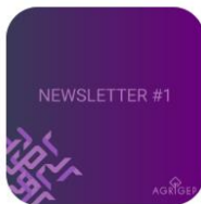
First NEWSLETTER is released!