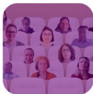
Agrigep Annual meeting