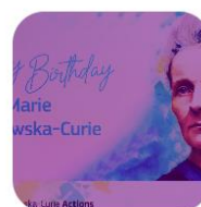
Celebrating the 156th anniversary of Marie Skłodowska-Curie's birth